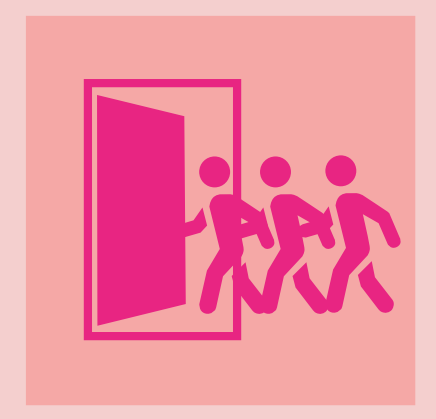
An increase in the number of people visiting the property