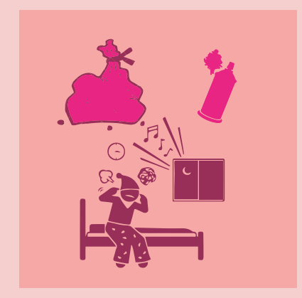
An increase in antisocial behaviour