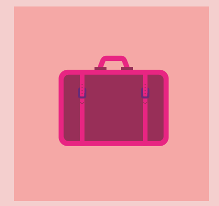
Individuals or families staying away while unknown individuals remain