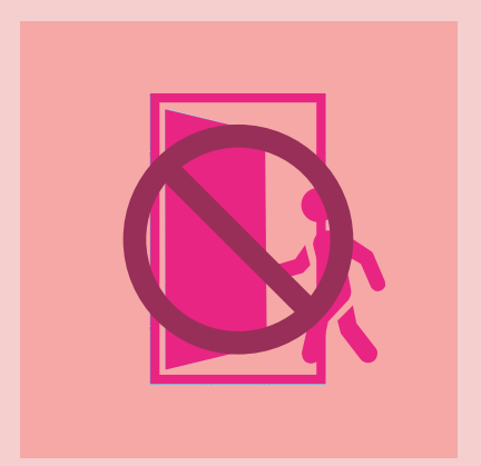
Restricting access to parts of the property to friends or professionals