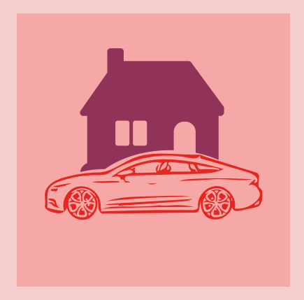
New vehicles regularly parking or remaining outside the property

The following signs may indicate that an individual or family's property has been cuckooed